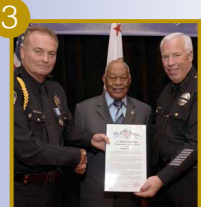
Airport Police Awards