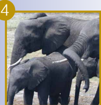
My Best Shot