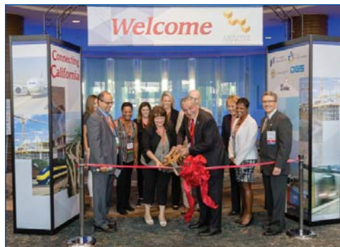
CalCon host agency representatives and state and local elected officials kick off the 2016 Expo.

"Design, Build, Progress" was the mantra of the 2016 California Construction Expo, held at the Long Beach Convention Center on July 28. More than 1,000 construction industry professional attended the expo hosted by Los Angeles World Airports (LAWA), Port of Los Angeles, Metropolitan Water District, California Department of General Services, and the Association of General Contractors-CA. CalCon is the state's premiere gathering for contractors, designers, construction professionals, suppliers and construction workers interested in public sector projects.