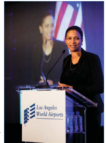
LAWA Executive Director Deborah Flint speaks to the attendees.

The overall LAMP will deliver a world-class transportation system for LAX that is designed to relieve traffic congestion within the Central Terminal Area and on surrounding streets, improve access options and the overall airport guest experience for travelers, and connect via a station to Metro's light-rail system. Major components of the program are expected to be completed by 2023. For more information, visit the LAMP website at http://connectinglax .