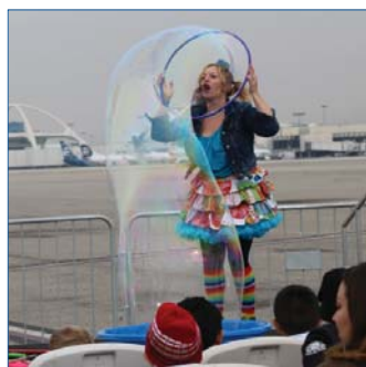
Silly Sally entertaining the students.