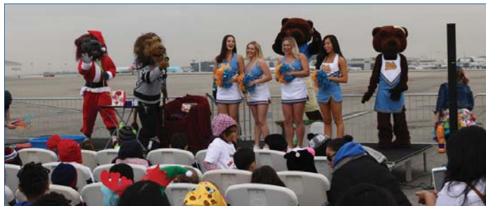
Mascots and cheerleaders lead the children in singing holiday songs.