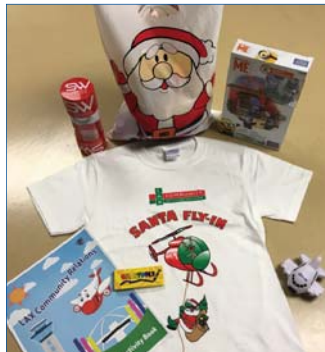
T-shirts and goodie bags each student received at the event.