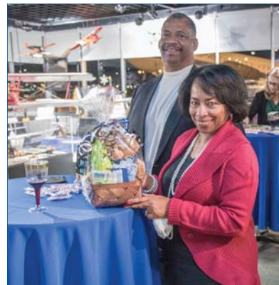
One of the raffle prize winners from the mixer.

Guests including community leaders from Chambers of Commerce, Rotary Clubs, Kiwanis, Councils, and LAX Area Advisory Committees, were treated savory food, spirited entertainment, and lively conversation.