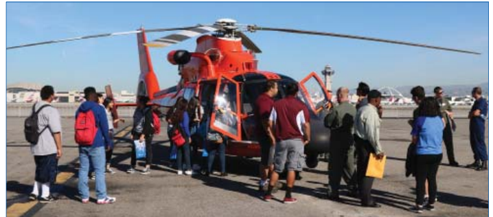
Students got to sit in a Coast Guard helicopter and speak with pilots about their careers.

LAX officials welcomed more than 700 local high school students to the first annual LAX Aviation Career Day in November. The event, hosted by LAX Community Relations, focused on giving students the opportunity to discover careers in the aviation field.