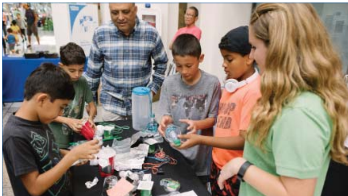
Boeing STEM Challenge

There were new interactive activities at this year's event including a STEM challenge for local middle school and high school students sponsored by Boeing in partnership with LMU's Seaver School of Science and Engineering, and breakout education sessions on the history of the Goodyear Blimp and on LAX's Landside Access Modernization Program. Event attendance was 33 percent higher than in 2015.