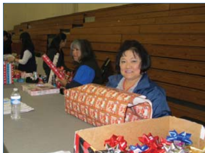
Team LAWA volunteer wrapping gifts.

The season of giving is alive and well at LAX! Employees volunteered to join Santa's team of holiday gift wrappers through the Team LAWA program in support of St. Margaret's Center's Holiday Program in December at Morningside High School in Inglewood. Toys are provided to over 1,000 children who attend the annual program.