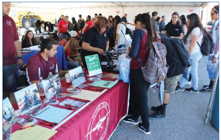
High school students had the opportunity to meet with various aviation and aerospace representatives during the Aviation Career Day.