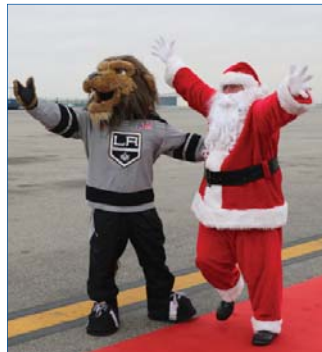
LA Kings mascot Bailey with Santa.