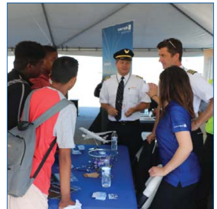
High school students spoke with United Airlines pilots and representatives to learn more about opportunities in aviation.

LAX Aviation Career Day featured more than 30 exhibitors from airlines, the Transportation Security Administration (TSA), Customs and Border Protection, Los Angeles Airport Police, air cargo companies, and other aviation/aerospace companies. Student attendees met industry professionals, viewed interactive exhibits, toured helicopters and Beechcraft and Cessna aircraft, and saw live demonstrations.